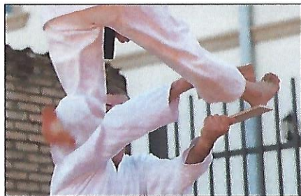
A member of BreakThrough breaking a board with her foot