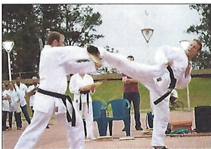
BreakThrough performing a demo in the park

● BreakThrough Taekwondo Team . Over 3,500 people living in Ciudad del Este, Paraguay, heard the saving gospel of Jesus Christ August 2-13! The Taekwondo team, BreakThrough , affiliated with Grace Ministries International shared this message through thirteen 45-minute, high-energy demonstrations performed in schools, parks, and other public areas. The presentations depicted man's sin and our need for salvation through faith in Christ, and His death and resurrection, telling the story both through martial arts and the Word of God. In the